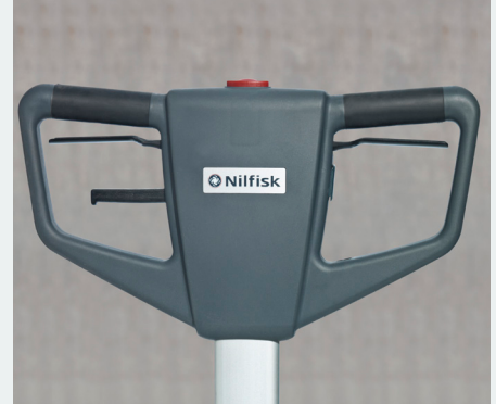
Ergonomic handle, with smooth round edges, easier operation and less fatigue