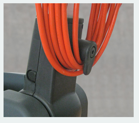
Cable hook for greater comfort